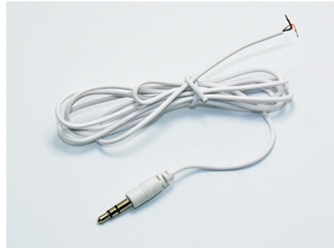
Plate of white glue nickel plating,ROHS

Three core (0.08*8) contact pin : 3.5*4.5